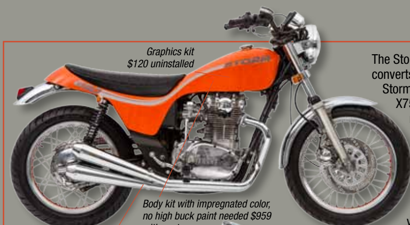
Graphics kit $120 uninstalled